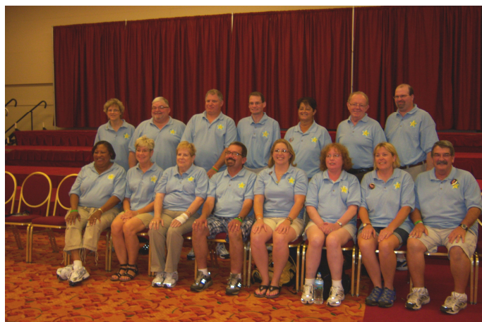
Team Upstate New York

Editor's note: Come meet members of the team at the next Tao meeting.